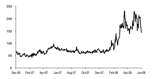
Daily VAR (trading and non-trading) (US$m)

The major contributor to the trading and non-trading VAR for the Group was Global Markets.