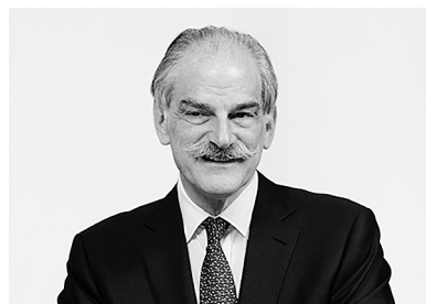
John Lipsky Independent non-executive Director