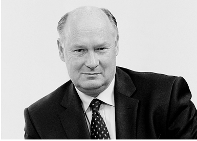
Douglas Flint, CBE Group Chairman